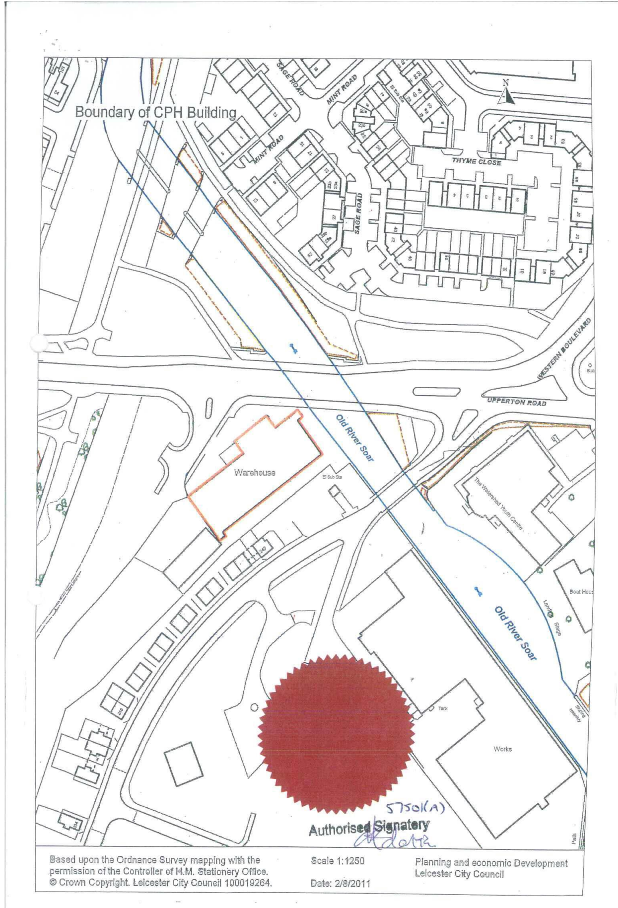
The area edged red defines the extent of the attached Article 4 Direction