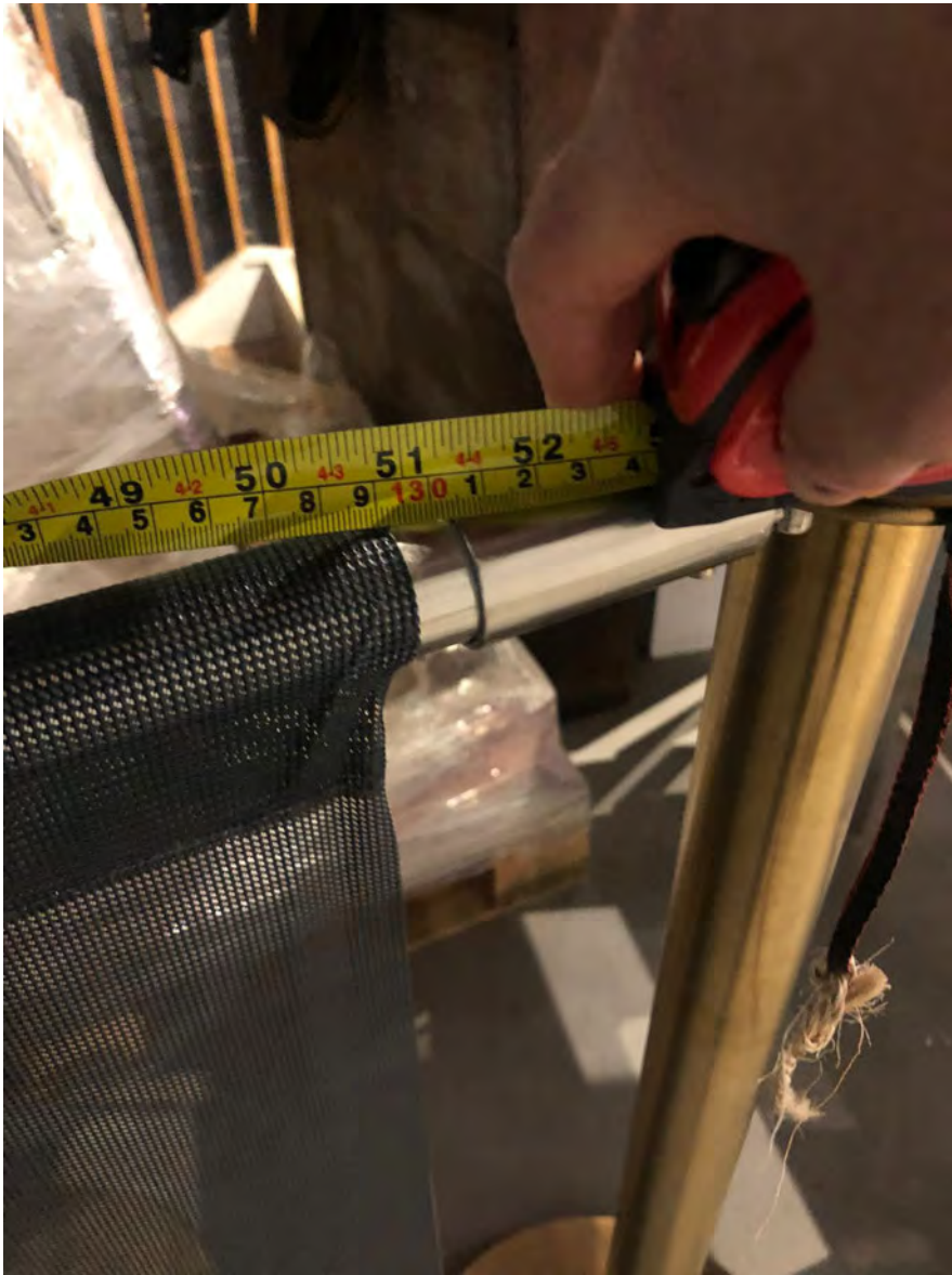
Yes I am happy to proceed with payment

I also attached the barrier that we will use