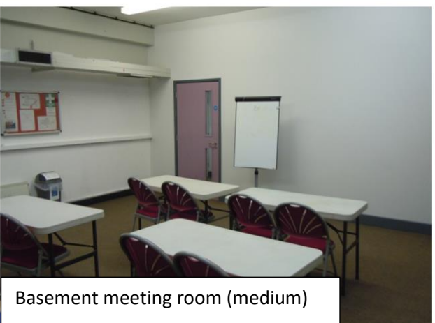
Basement meeting room (medium)