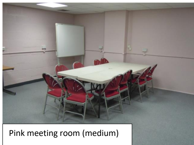
Pink meeting room (medium)