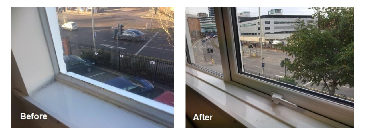
Inside view of the windows before (left) and after (right) the double glazing was installed at Fashion UK

Green BELLE was part-funded by the European Regional Development Fund and was administered by Leicester City Council with support from Leicestershire County Council. The scheme provided grant funding to eligible SMEs to install energy efficiency measures from 2017 to May 2023.