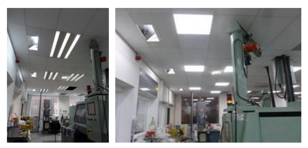
Left: Lighting before Green BELLE LED installation at Lestercast Limited Right: LED lighting installed at Lestercast Limited

Lestercast Limited is a precision investment casting manufacturer and offers bespoke components in a range of metals and specialist alloys for industrial and commercial applications.