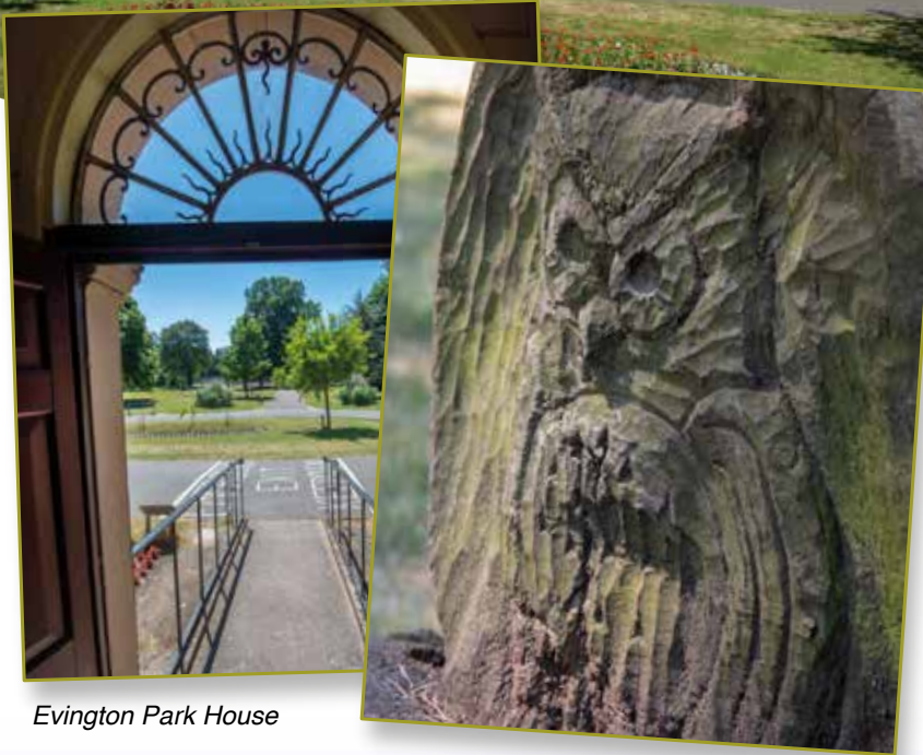
Evington Park House