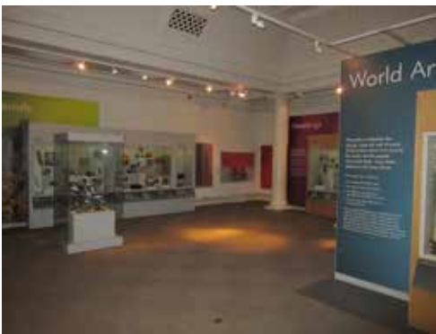
First Floor Foyer