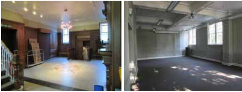
Council Room – Meeting Room