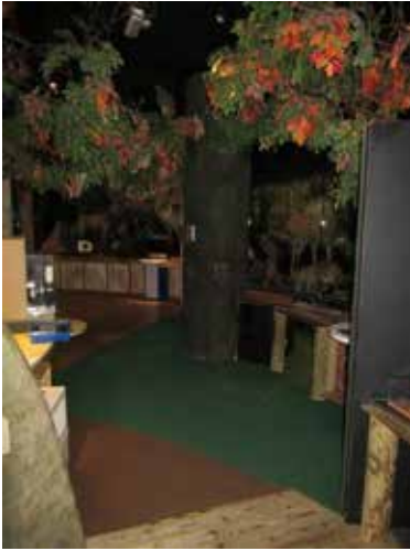
Victorian Art Gallery