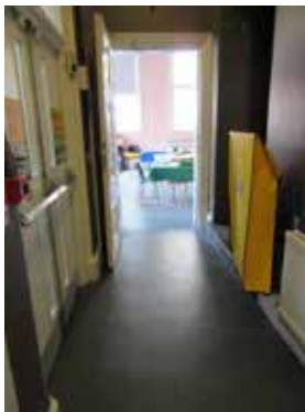
Lift (Ground Floor)