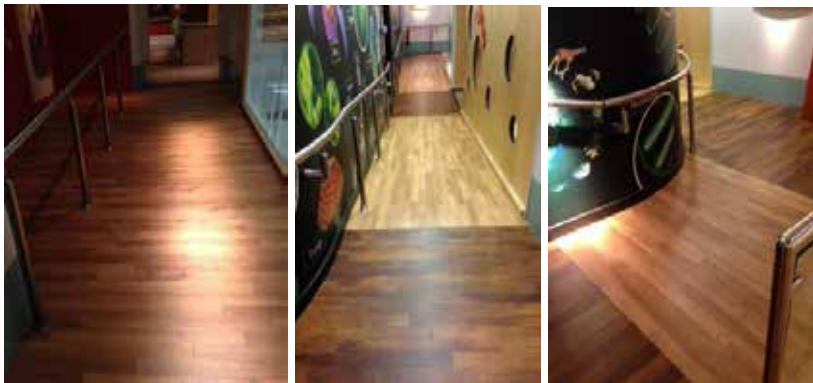
Ancient Egypt Gallery