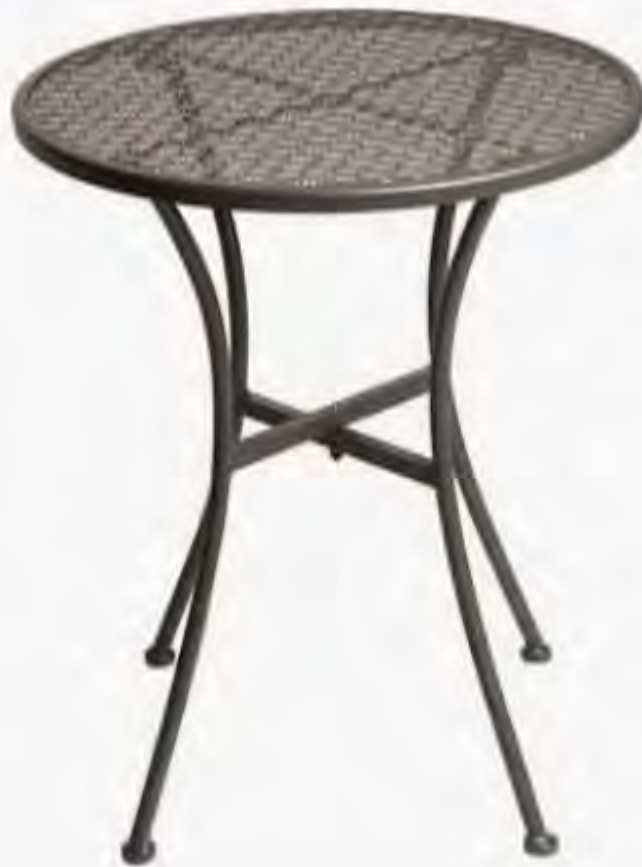
Bolero Round Steel Patterned Bistro Table Grey 600mm