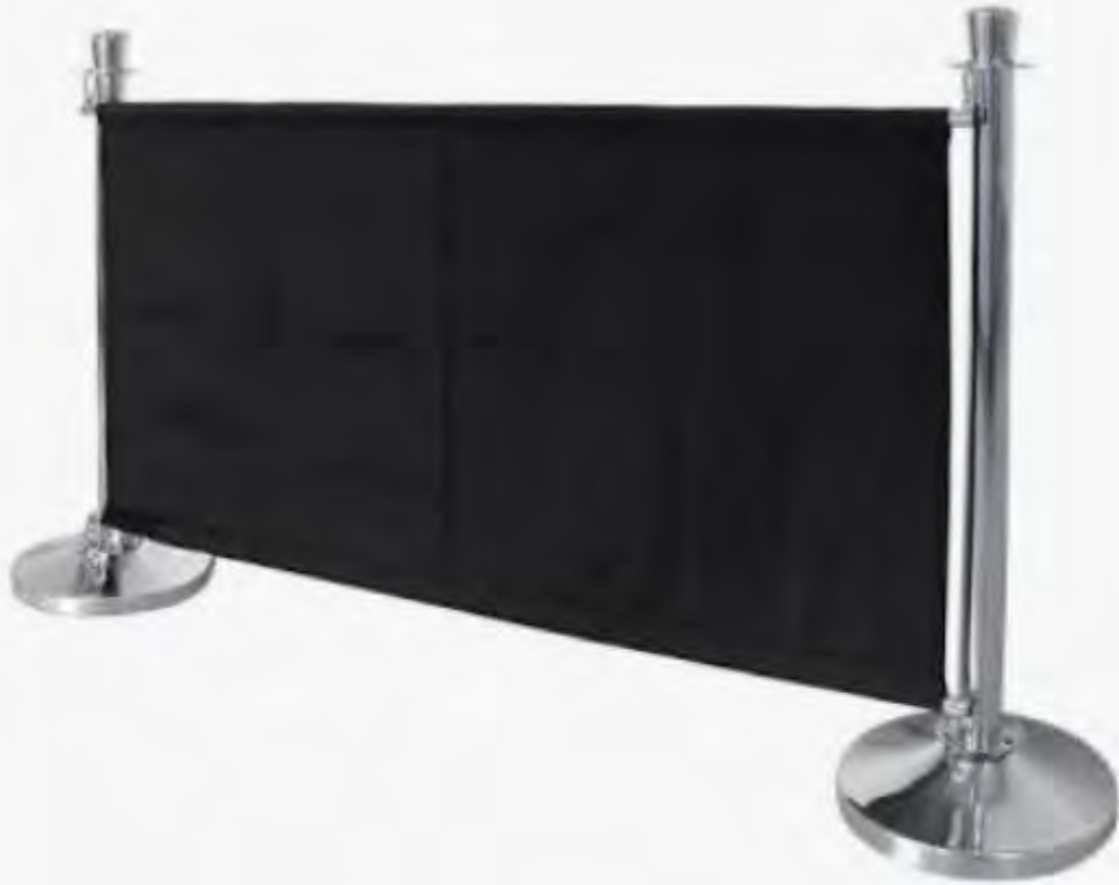
Bolero Black Canvas Barrier