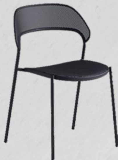
ARIEL STEEL DINING CHAIR