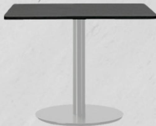
ARIEL STEEL DINING TABLE